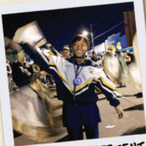
OVER 100 DIFFERENT MARCHING BANDS