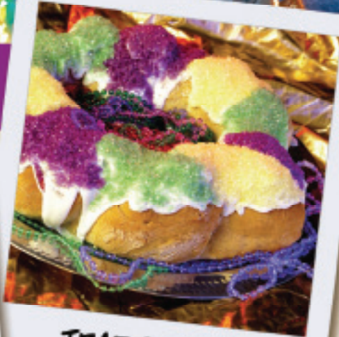
TRADITIONAL KING CAKES